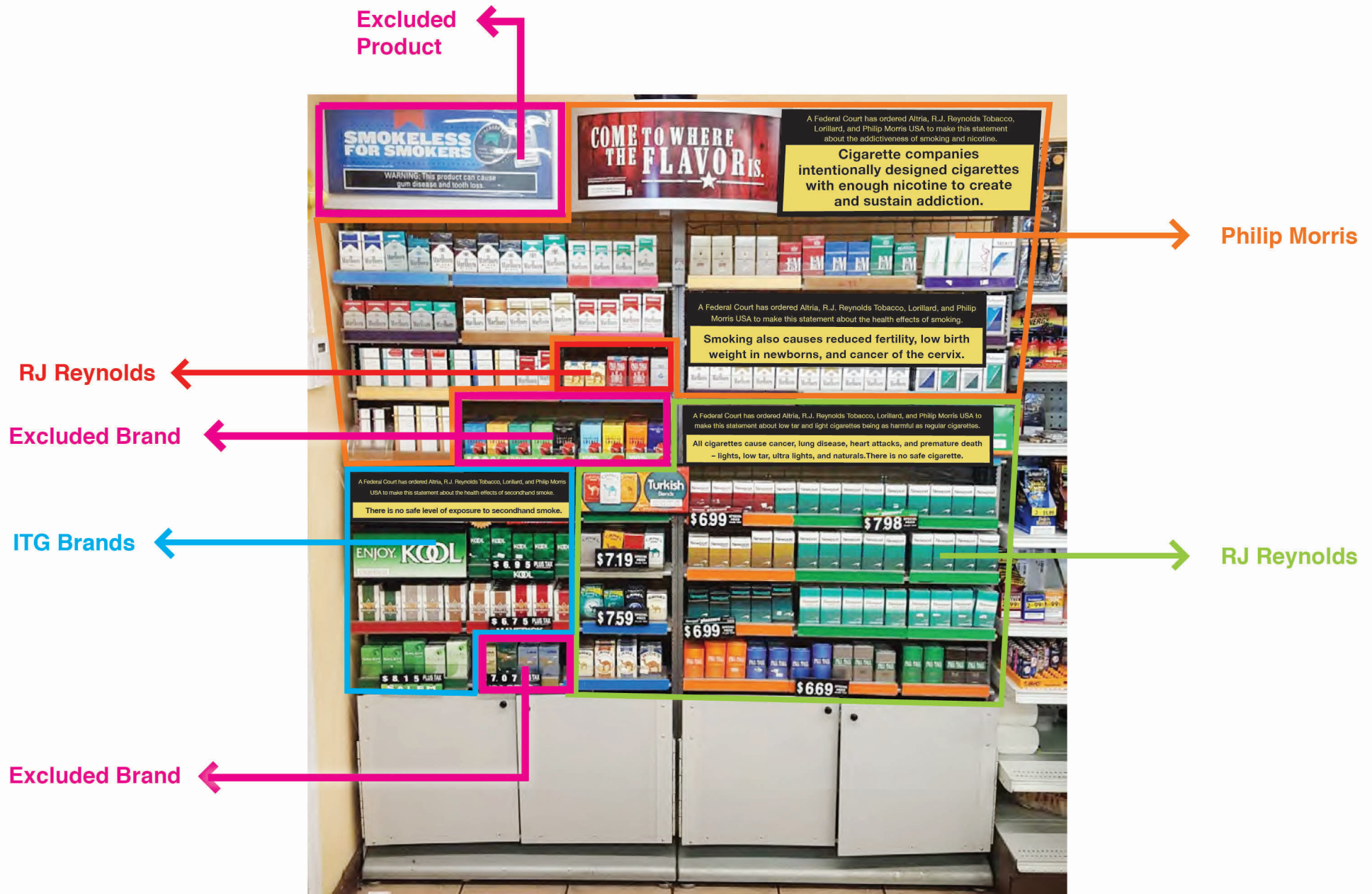
Same source image; showing manufacturer and “excluded brand” boundaries