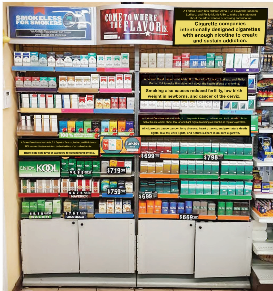
Same source image; showing court-order statements in a fixed percentage of 25% of each manufacturer's "covered brand" area